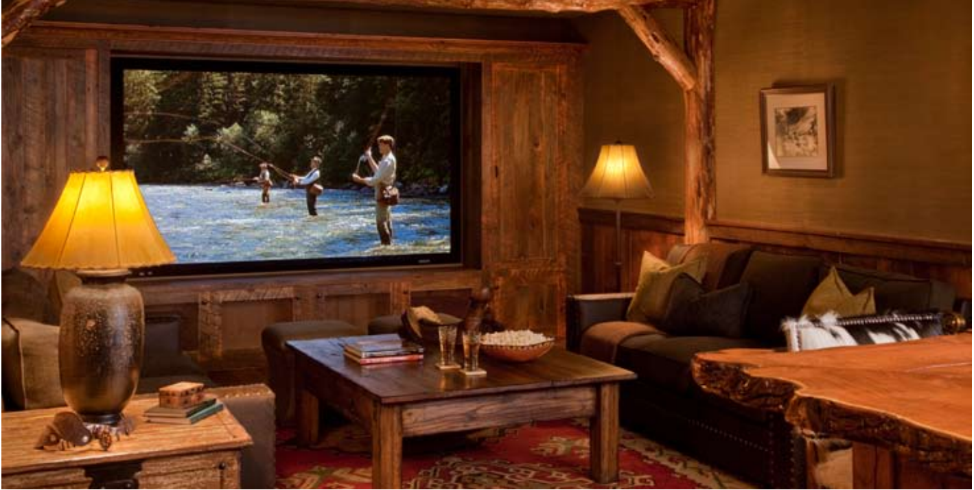
Above: A customized theater room flanks the old saloon downstairs. Opposite: Outdoor spaces were created to enjoy views to the east of the Absaroka Range.

styles. As a fourth-generation builder, Ryan has knowledge of construction in the classic historic forms seen throughout the eastern portion of the United States and other architectural styles that range from highly rustic to ultra modern.